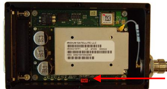
Red jumper used to set input voltage range

NOTE: To reset the input voltage range back to 4.0 V to +5.5 V, set the red jumper onto the middle and right pins.